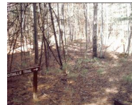
Trail Head Sign

Please Note: These web pages are for entertainment purposes. The author(s) and owners assume no liability whatsoever for any information presented here. Much of it may have factual errors or is purely subjective opinion.