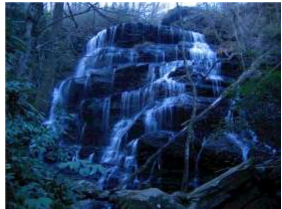
Yellow Branch Falls