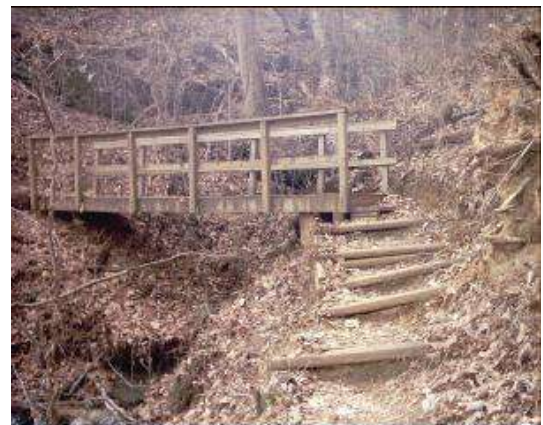
Small Wooden Bridge

Please Note: This site is for entertainment purposes. The author(s) of this site assume no liability whatsoever for any information presented here. Much of it has factual errors or is purely subjective opinion.