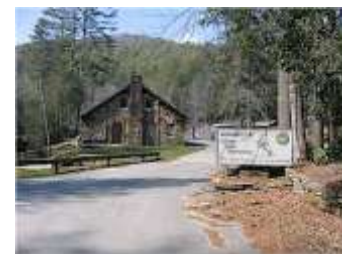
Walhalla Fish Hatcher