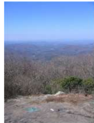
View from Summit