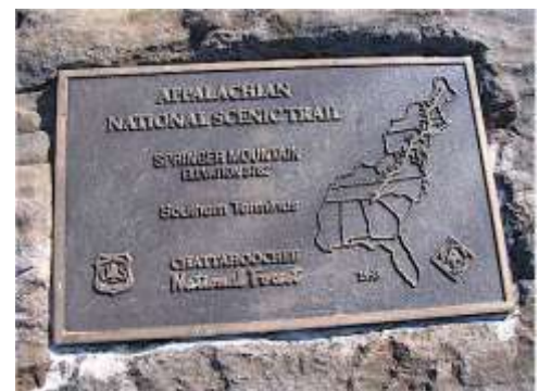
Appalachian Trail Plaque

Please Note: This site is for entertainment purposes. The author(s) of this site assume no liability whatsoever for any information presented here. Much of it has factual errors or is purely subjective opinion.