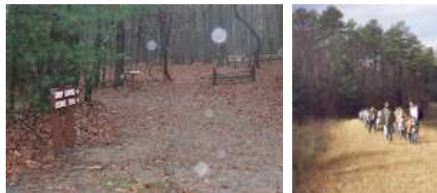
Trailhead -- Dam

Please Note: This site is for entertainment purposes. The author(s) of this site assume no liability whatsoever for any information presented here. Much of it has factual errors or is purely subjective opinion.