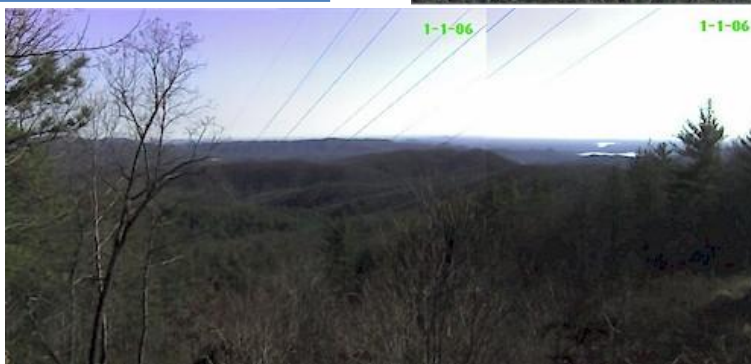
Lakes Jocassee and Keowee in Distance

Please Note: These web pages are for entertainment purposes. The author(s) and owners assume no liability whatsoever for any information presented here. Much of it may have factual errors or is purely subjective opinion.