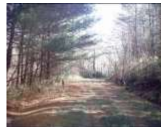
Second Gravel Road

Please Note: This site is for entertainment purposes. The author(s) of this site assume no liability whatsoever for any information presented here. Much of it has factual errors or is purely subjective opinion.