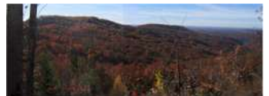
View from Road 744C in Fall

Please Note: This site is for entertainment purposes. The author(s) of this site assume no liability whatsoever for any information presented here. Much of it has factual errors or is purely subjective opinion.